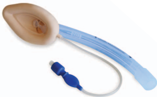
LMA Classic Excel™ with removable connector allows up to a size 7.5 ETT